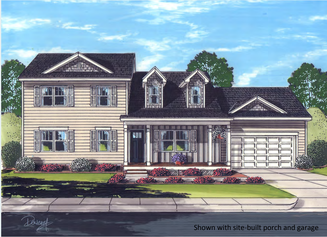
Shown with site-built porch and garage